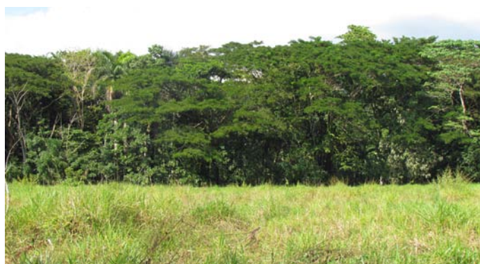
Figure 4 forest