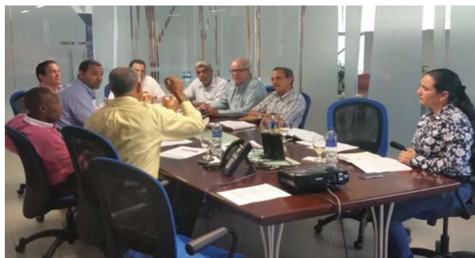
Figure 6 Board of Directors of the Colinas Bajas Model Forest regional platform, at an ordinary territorial management meeting, 2016.

What makes this project special is the participation of many stakeholders. As a measure for participatory implementation, a “Round Table” was established, which was founded in 2010 by local actors, the FAO and Enda Dominicana. Different working groups work separately on specific topics and problems. For the Model Forest General Assembly, however, they all meet regularly.