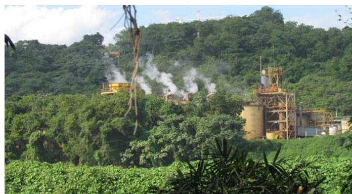
Figure 1 goldmine

The target group of this project are the smallholder farmers in rural areas with 0.5-1.5 ha of land. Through the donation of the goldmine, around 65,000 families in the region of Colinas Bajas have been supported for 11 years by the local NGO to establish forests and cocoa agroforestry systems. The aim was to restore the region to its original forested state in the long term. To generate a sustainable source of income for the people, the NGO Enda set up small wood-processing companies within the framework of the project, which sell the wood from the forest and agroforestry areas of the smallholder farmers.