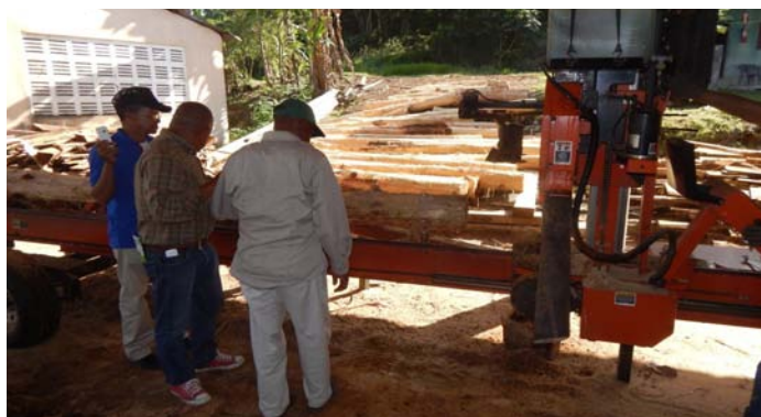
Figure 7 picture sawmill Torsten Klimpel

Another project component focused on the processing of wood from the newly created forest and agroforestry areas. For this purpose, small pilot-sawmills were set up in the communities. They are managed by the wood producers in small cooperatives or as private micro-enterprises. This has resulted in a new source of income for many entrepreneurs. However, not all of these forest enterprises survived, as some of them were not financially viable. According to the stakeholders, there was mismanagement within the companies and there was a lack of business know-how and sales markets. The micro-enterprises process the wood to boards and blocks, dry it with solar energy or air-drying. In addition, some joineries were founded as micro-enterprises where all local unprocessed sawn timber is sold, both regionally and nationally. Some members of the micro-enterprises had their wood FSC® certified.