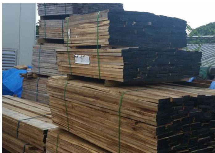
Sawmills process the wood for further processing in joineries or for sale.

Crucial for the implementation of a Forest Landscape Restoration project was the locally represented NGO . It has the local knowledge, access to the smallholders and is familiar with the region Colinas Bajas. At the same time, the NGO as an organization was able to generate larger financial resources and pass them on to the individual farmers. Without this organization, the goldmine would probably not have been able to invest such a large amount of money in the region. This demonstrates that there has to be an actor between the investor and the target group who implements the investment and functions as a bridge between both actors.