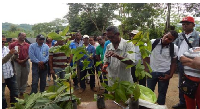
Figure 3 cocoa grafting workshop with a local cocoa producers' association. Bosque Modelo Colinas Bajas

The concept „Model Forest“ comprises a process that establishes a diverse partnership of individuals and groups in order to realize the common vision of a sustainable landscape development. Geographically speaking a model forest is a functioning landscape that combines different forms of use, such as forests, agriculture, protected areas and cities. The model forest concept is already being applied in various countries. In Colinas Bajas, the NGO Enda developed a concept, which reforested the landscape in four reforestation phases. These phases are explained on the next page.